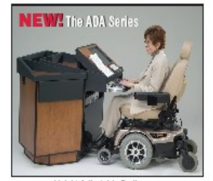
Height Adjustable Podium — Wheelchair Accessible, ADA Compliant!