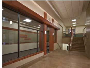
STEVENS COUNTY COURTHOUSE MORRIS, MN

KMA HAS COMPLETED MORE THAN 100 COURTS AND DETENTION STUDIES AND PROJECTS AT THE COUNTY, STATE AND FEDERAL LEVELS.