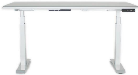
Series2 Height Adjustable Table

Change your altitude while sitting in a cloud of comfort